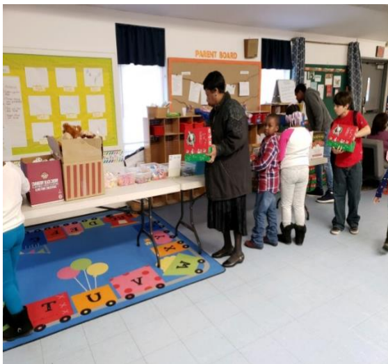
Packing the boxes