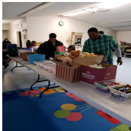
Another view of packing the boxes